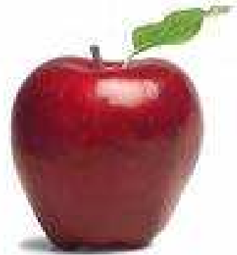
The apple is red.