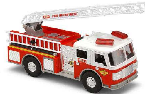
The fire engine is red.